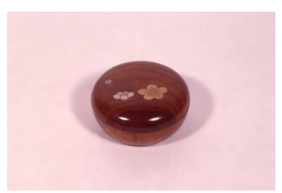
Plum-tree-in-front-of-garden incense container Favored by Nintokusai Property of the Chado Research Center