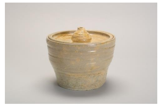
Tub-shaped water jar Made by Nintokusai Property of Konnichian