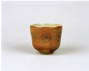
Tea bowl with design of chrysanthemums. Made by Nonomura Ninsei. (Throughout exhibition period)