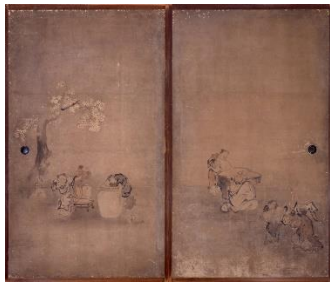
Kan'untei fusuma, Cherry Blossoms. Painting attributed to Kanō Tan'yū. Urasenke Konnichian collection. (Terms I & II)