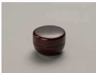
Kan'un incense container. Favored by Urasenke 9 th gen., Fukensai. Chado Research Center collection. (Terms II & III).