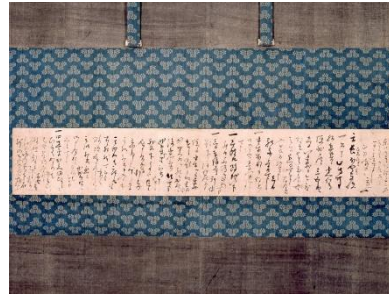
Hanging scroll, Letter to Genshitsu dated "first month last day", written by Sōtan. (April 18–May 26)