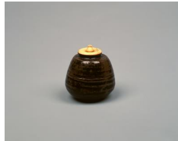
Old Seto ware shiribari style tea caddy named "Iwane". (Throughout exhibition period)