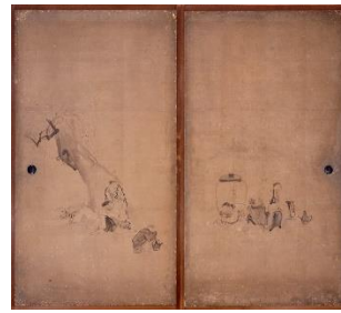
Kan'untei fusuma, Wrong Hand. Painting attributed to Kanō Tan'yū. Urasenke Konnichian collection. (Terms I & III)