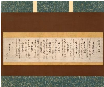
Hanging scroll, "Nine Scenes in the Garden", written by Gengensai. Urasenke Konnichian collection. (April 18–May 26)